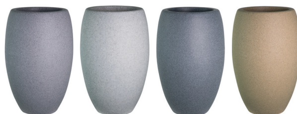
Grey Granite Light Marble Dark Granite Sandstone